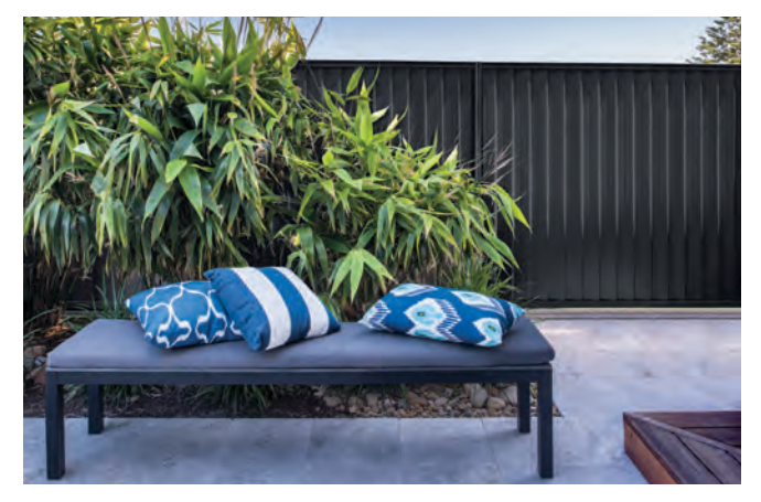
Fence colour: Monument®

GOOD-LOOKING, EASY TO MAINTAIN, AND DURABLE. When it comes to choosing a fence, we understand that it's not just how great the fence looks that matters, but also how well it does its job, and how much time and effort it takes to ensure it stays up to the task.