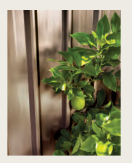
Fence colour: Riversand®